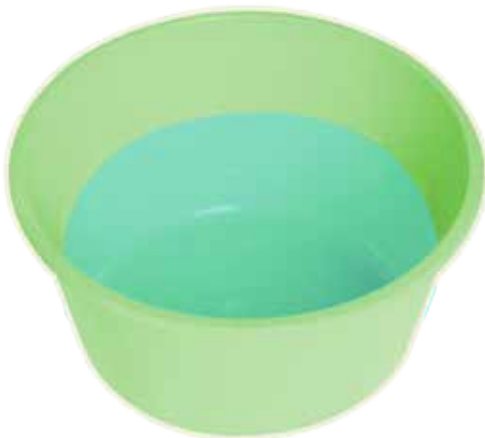
Bowl of lukewarm water